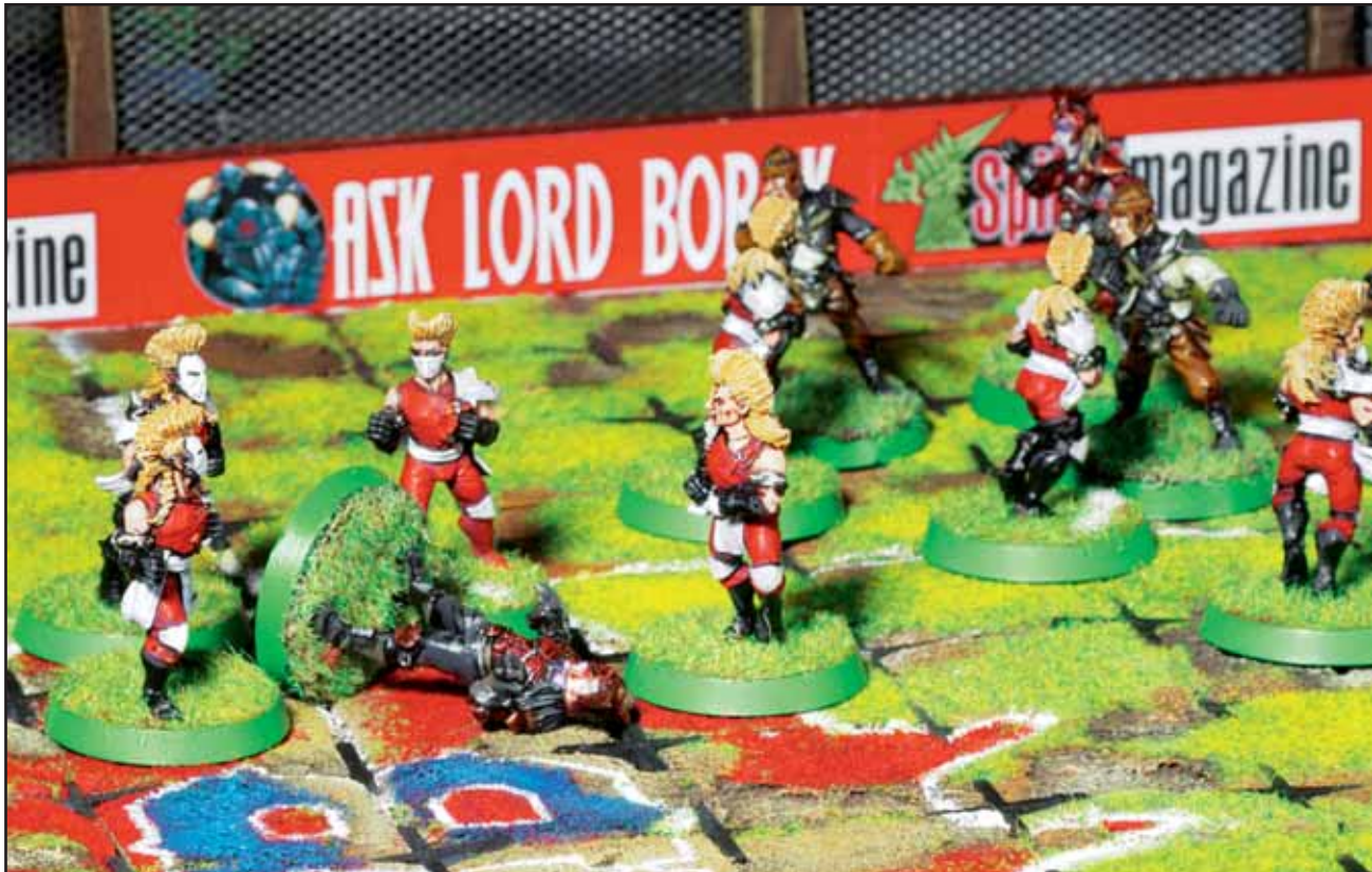
The Elves put the boot in whilst holding off the rest of the team.

The odds of getting sent off aren't exactly 1/6 or 1/2 because you can argue the call. So long as you can argue you should. There is no effect if you should get sent off yourself, other than that you can no longer argue the call. So it's a 5/36 chance, or 15/36 if the Eye is on you, of getting sent off.