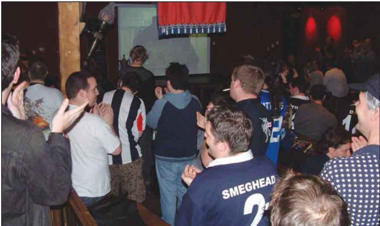
Everyone gets together to watch the final on the big screen in Bugman's.