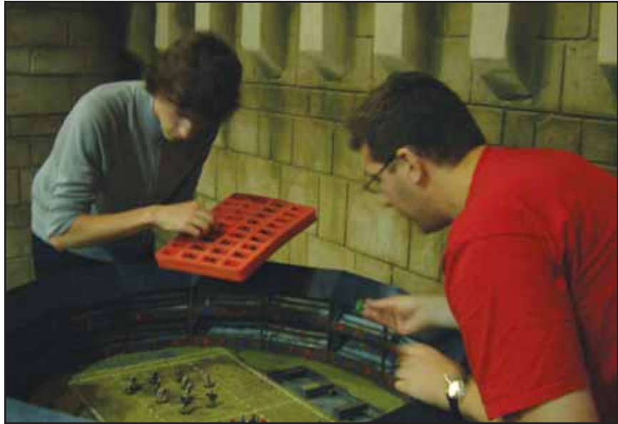
The finalist prepare for battle in the big arena.

Smarting from my defeat I trudge down the second isle to face my next opponent. Oh look – another Lizardmen team! Yet with a subtle variation of only four Skinks, but with the world's supply of Saurus and a Kroxigor! Great! Well at least this guy must have lost his last game too since I had noticed him sitting quite close on the last round. I sit down and shake his hand, and it's only now I notice what's written on his baseball cap: WORLD LEAGUE CHAMPION! It's here that my beard starts to show, after my defeat in the previous game I decided to take something with a little punch so that when I knocked someone down they would stay down, so there in the middle of my roster was a Dirty Player. I had started the tournament determined to prove