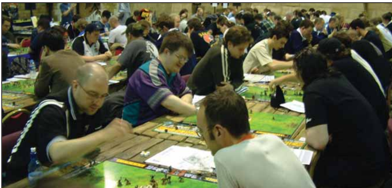
Furious Blood Bowling action in progress.

tournaments all over the world. If you're interested, pop along to www.bloodbowl.net and have a look.