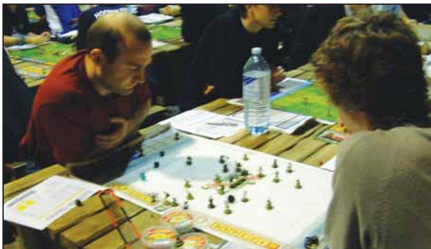
Blood Bowl on ice. One of the many unusual boards we found for the event.

With the second game out of the way I sat down to look at the performance of my team. Dump Off had worked well for what I had planned for it although the tendency for my Thrower to not throw an accurate pass resulted in the Catcher who stood with him having to make several rolls to pick up the ball. With this in mind my second skill choice was Sure Hands on my Catcher.