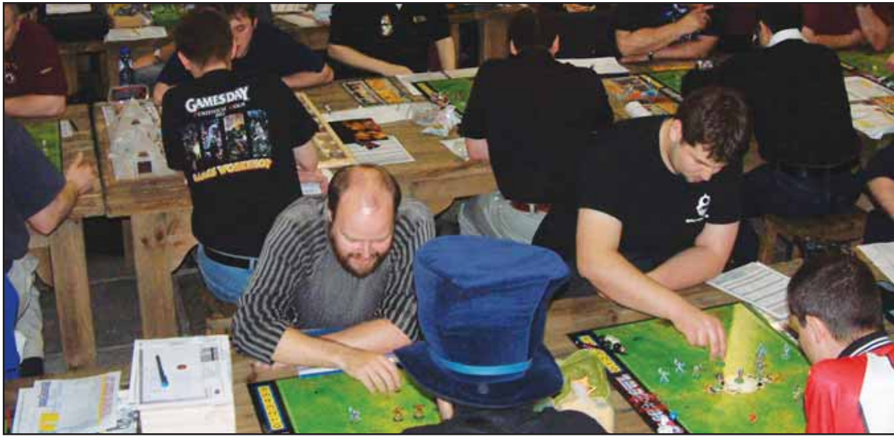
Some people will do anything to bring themselves luck – even wear silly hats.